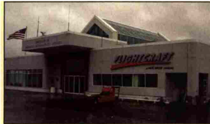
Airside view of Flightcraft's newly refurbished business aviation terminal at PDX.