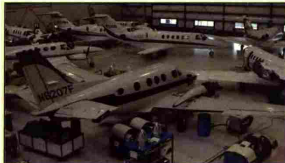
King Airs and Citations dominate maintenance work performed by Flightcraft PDX.